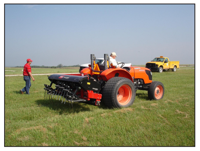
Figure 1. The Toro Deep Tine soil compactor and aerator. Note the long tines.